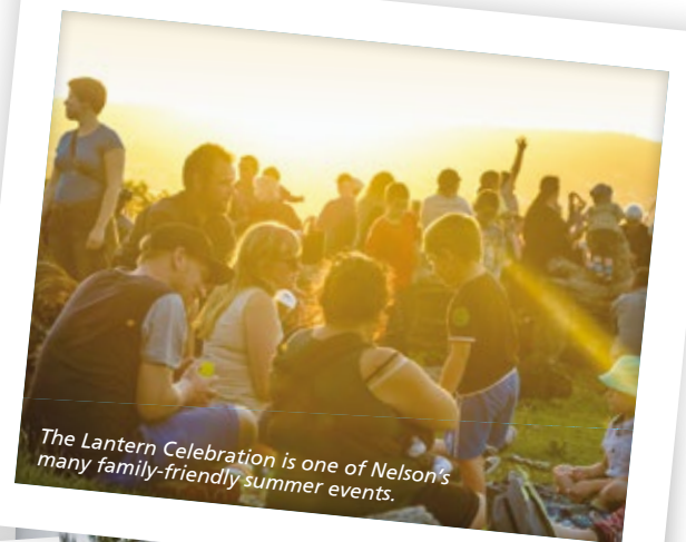
The Lantern Celebration is one of Nelson's many family-friendly summer events.