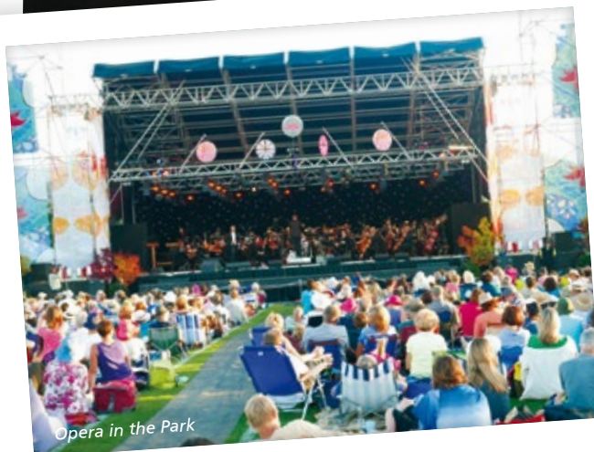
Opera in the Park