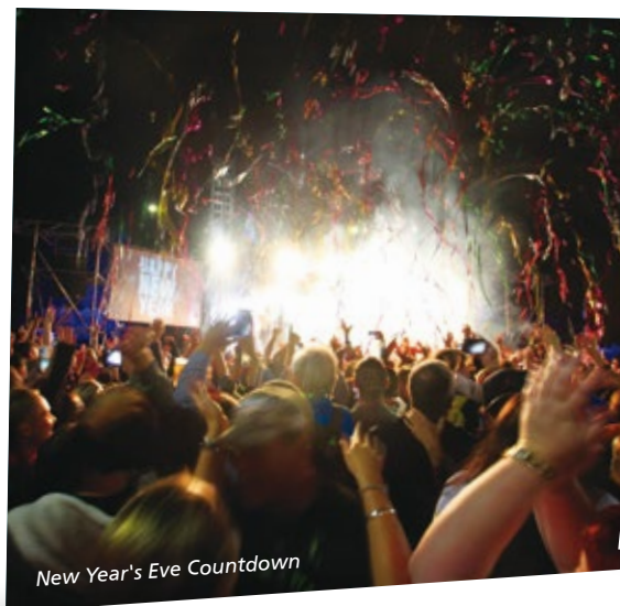
New Year's Eve Countdown

The Nelson Cathedral Christmas Tree Festival has officially opened and will be on display through until 27 January 2018.