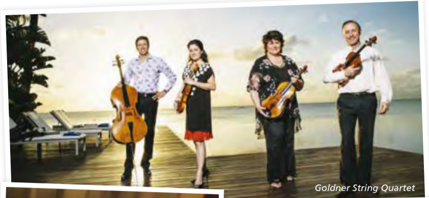
Goldner String Quartet