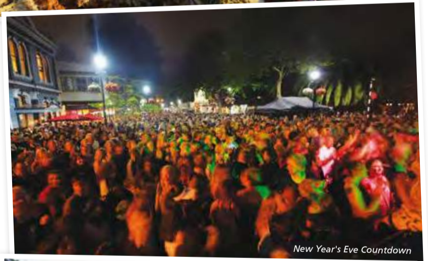
New Year's Eve Countdown