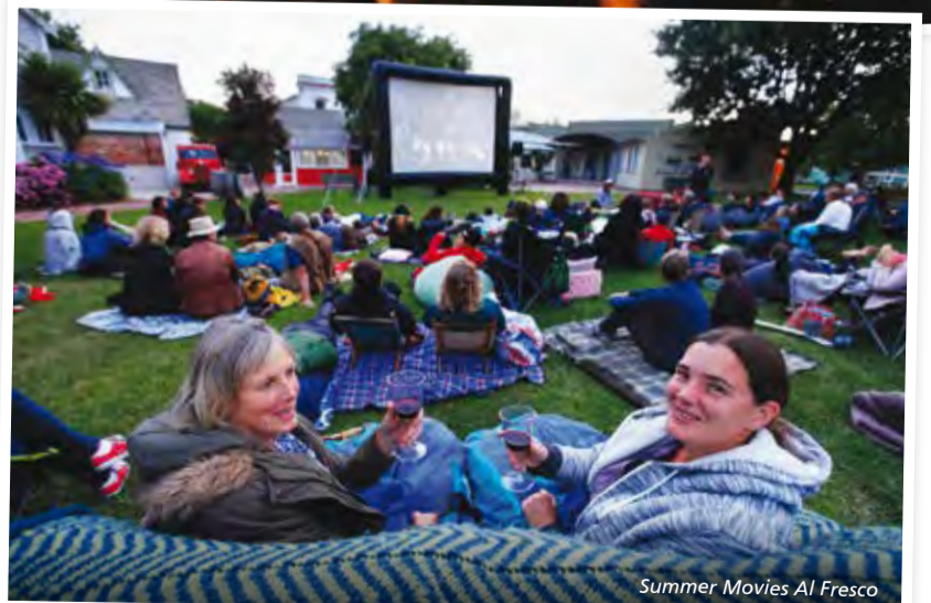
Summer Movies Al Fresco