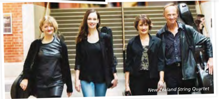
New Zealand String Quartet