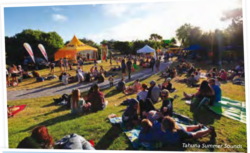
Tahuna Summer Sounds