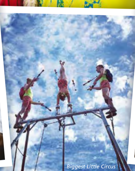
Biggest Little Circus