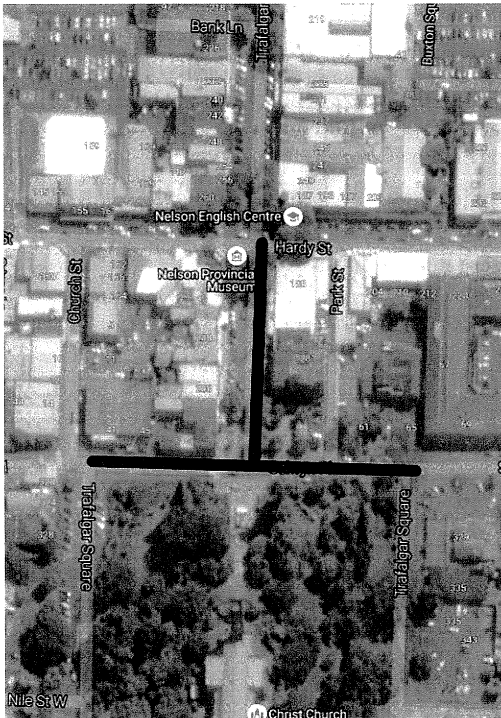
Figure 4—Map of Road Closures for the Christmas Carols by Candlelight