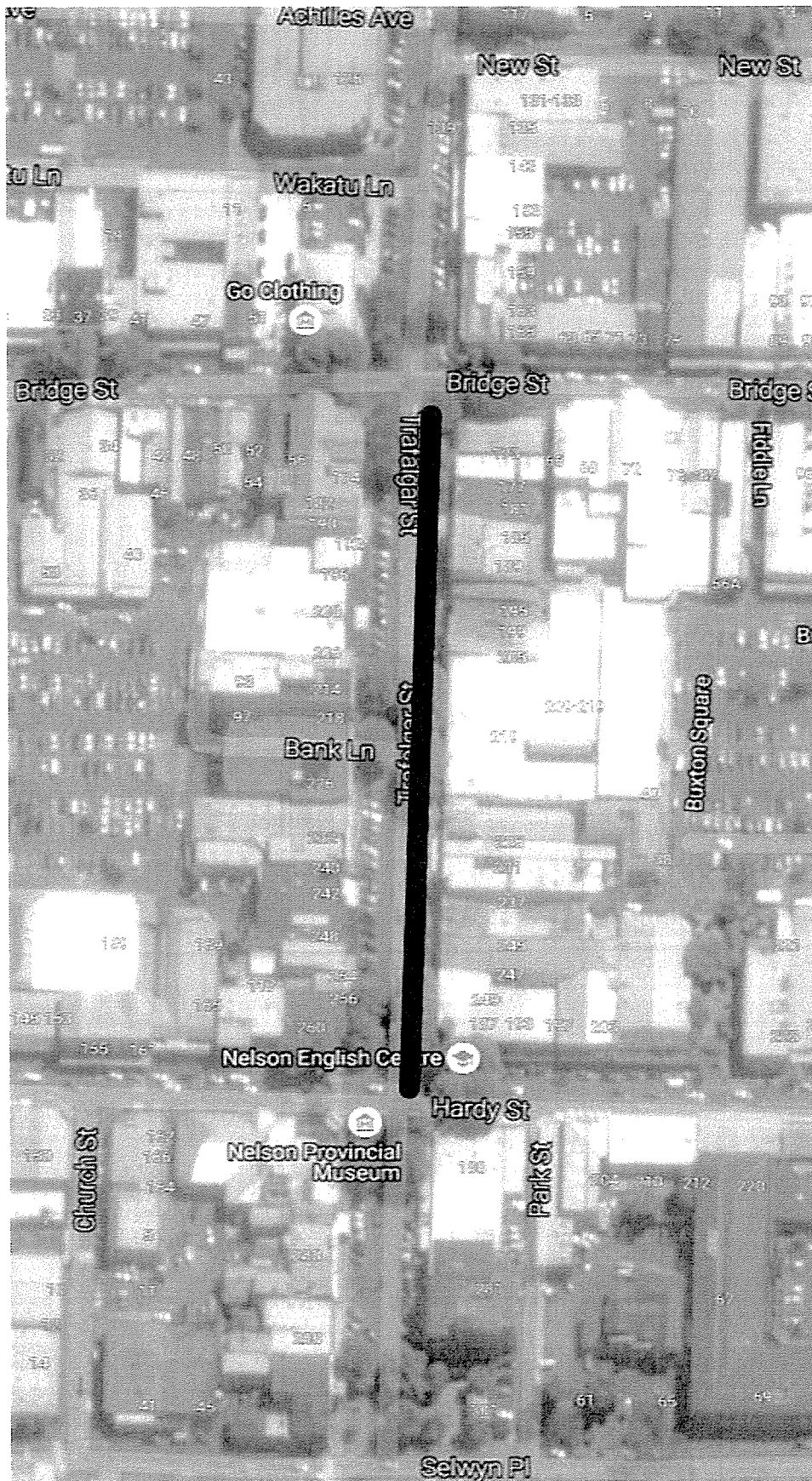
Figure 6—Map of the Road Closure for the Trafalgar Street Market Day